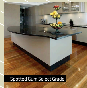
Spotted Gum Select Grade

Spotted gum is a large native hardwood that is grown in a variety of forest types along the NSW coastal strip into Queensland. The word "spotted" refers to large spot like features that form on the tree as it sheds its bark in strips.