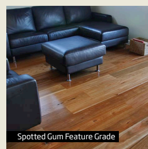
Spotted Gum Feature Grade