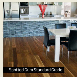
Spotted Gum Standard Grade

Hurford Hardwood insist that all timber produced from these forests is done so under the principles of Ecologically Sustainable Forest Management, a system developed to sustain the full range of commercial and conservation values of the natural forest diversity within ecological limits, for current and future generations.