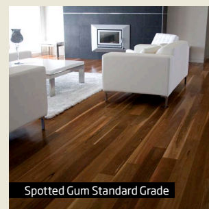
Spotted Gum Standard Grade